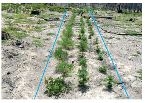
Squaw carpet control with Cleantraxx<sup>™</sup> at 3 pints/acre applied pre-emergence in spring 2013 (Photo taken approximately one year after treatment)