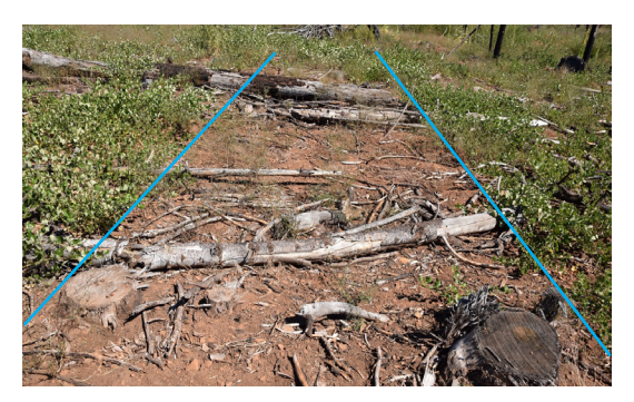
Snowbrush Ceanothus seedling control approximately 2 years after fall application with Cleantraxx<sup>™</sup> + Milestone<sup>®</sup> at 3 pt + 7 fl oz/acre applied October, 2014 (photo taken August, 2016)

For more information about Dow AgroSciences or any of our Industrial Management products, visit VegetationMgmt.com