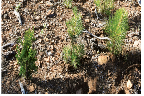
Incense cedar, sugar pine, and Ponderosa pine at 1 year after treatment with Cleantraxx<sup>™</sup> at 3 pints/acre + non-ionic surfactant at 0.25% v/v applied post bud break (2-3 inches of new growth on May 16, 2014). No herbicide symptoms observed, trees growing normally

<sup>™M</sup>Trademark of The Dow Chemical Company ("Dow") or an affiliated company of Dow Cleantraxx is not registered for sale or use in all states. Contact your state pesticide regulatory agency to determine if a product is registered for sale or use in your state. When treating areas in and around roadside or utility rights-of-way that are or will be grazed, haved or planted to forage, important label precautions apply regarding harvesting hay from treated sites, using manure from animals grazing on treated areas or rotating the treated area to sensitive crops. See the product label for details. State restrictions on the sale and use of Milestone apply. Consult the label before purchase or use for full details. Always read and follow label directions. ©2016 Dow AgroSciences LLC V01-419-002 DAS (11/16) 010-51094