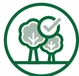
Tested and proven safe around trees