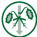
Systemic control of more than 100 broadleaf weeds