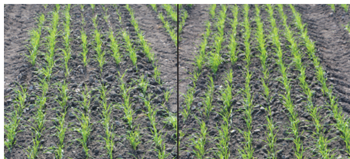
Standard Seed Treatment