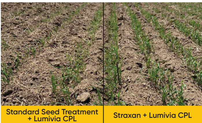
Medicine Hat, June 2023