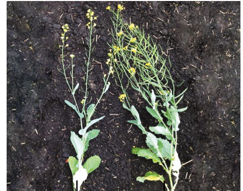
RT73 - 0.5 REL/ac applied sequentially at 4 leaf and 1st flower (not a labeled application timing)