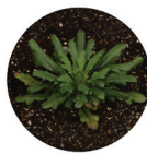
Eragon™ + glyphosate