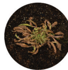
Elevore™ + glyphosate