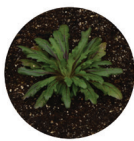
Elevore™ + glyphosate