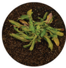
Elevore™ + glyphosate