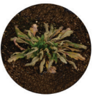
Eragon™ + glyphosate