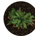
Eragon™ + glyphosate