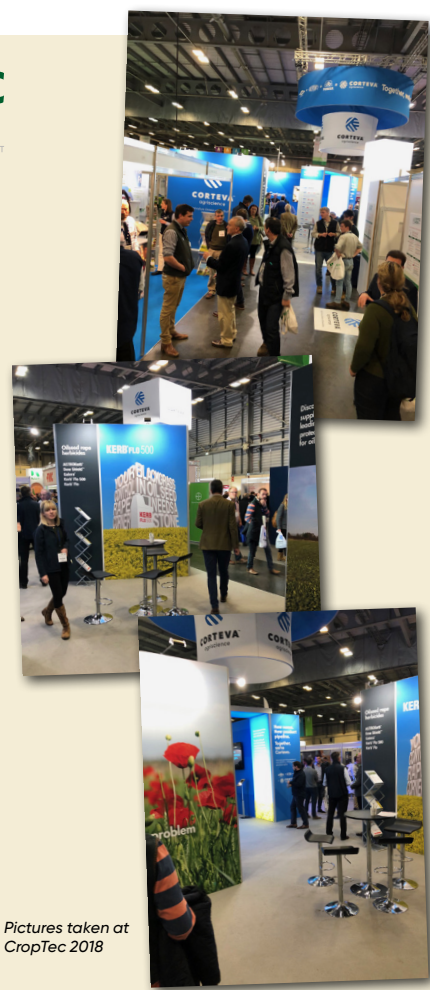
Pictures taken at CropTec 2018