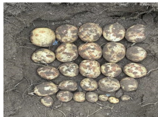
203 kg N 0.975 kg tubers