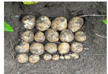
203 kg N + Utrisha N 2.03 kg tubers