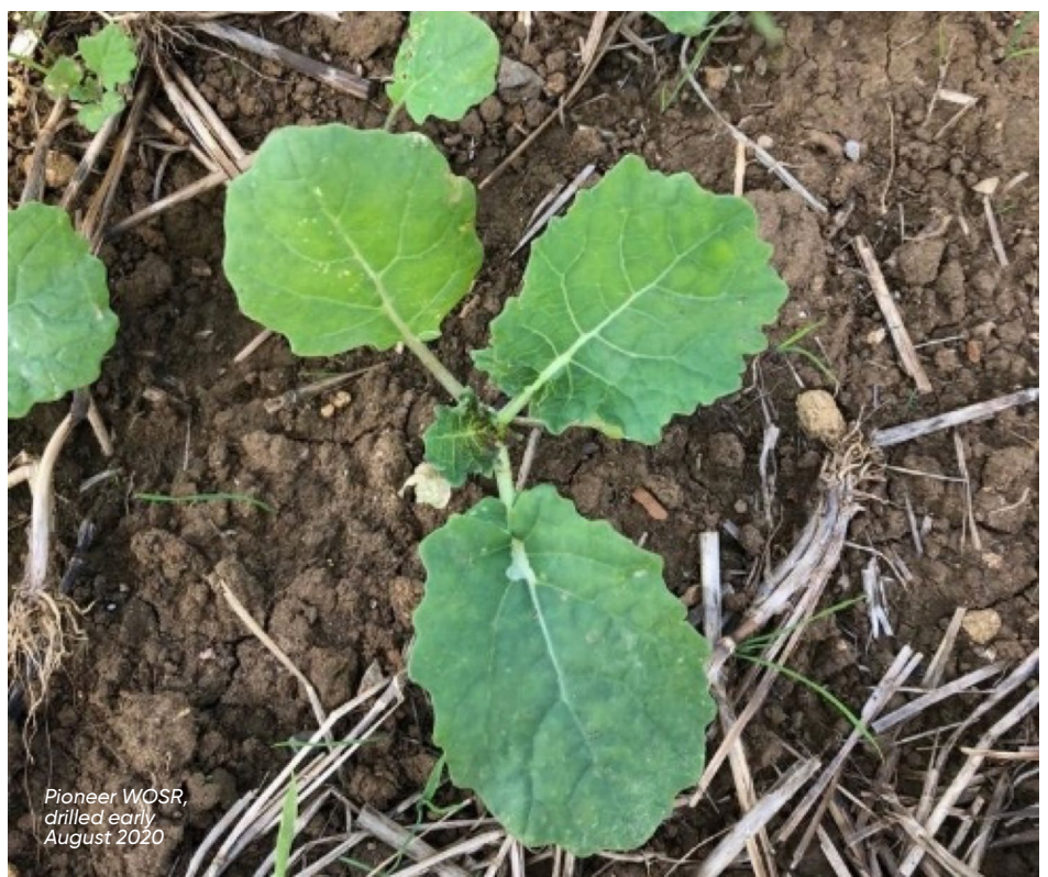
Pioneer WOSR, drilled early August 2020

the weed spectrum and tailor a reactive programme accordingly. Read our recent press release on this topic here .